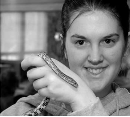
See animals under the care of Nature's Nursery at monthly open houses.