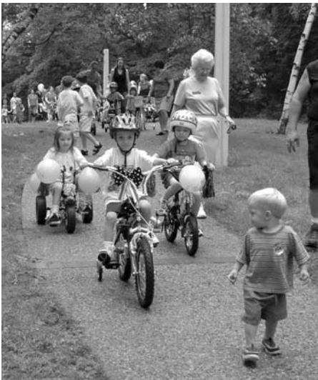
Kids will decorate their bikes and parade to the Manor House lawn June 20.