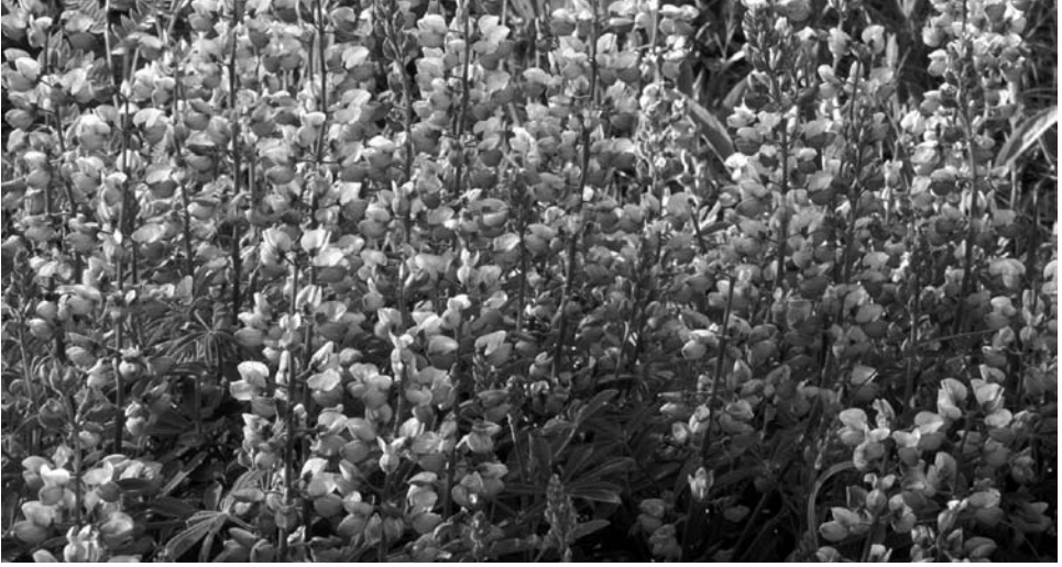
Bring your environmental club to Oak Openings June 26 to help collect seeds from the important lupine plant.