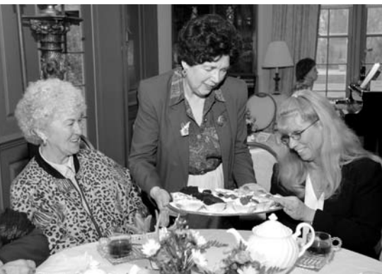
Time for tea – monthly in the Manor House.