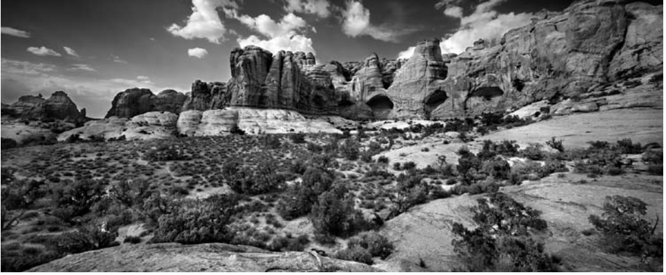
America's National Parks are captured in stunning black & white, large format images by Clyde Butcher, April 4 - June 28.