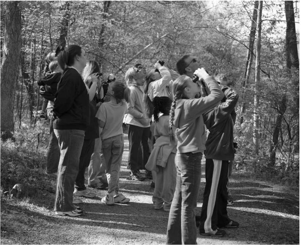
Kids will learn skills to begin a lifelong fascination with birding May 9, the peak of the best birding.