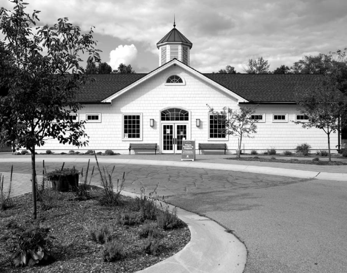
Ward Pavilion, Wildwood