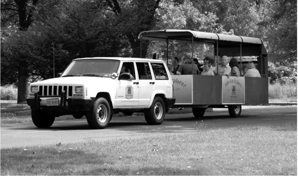
Board the Explorer for a relaxing ride along the river Tuesdays in May and June.