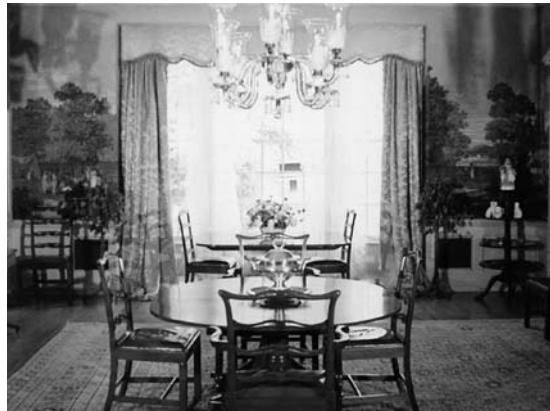
See the Manor House from a new perspective during a Behind The Scenes Tour.