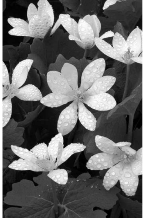
Spring wildflowers, such as bloodroot, are the topic of Senior and Accent on Accessibility programs.