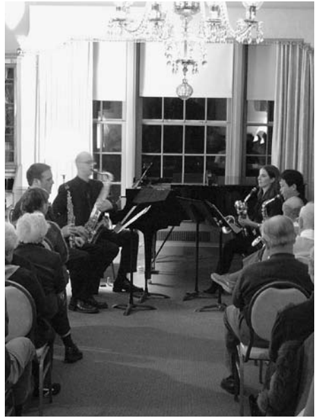
Enjoy a morning of music in the elegant Manor House living room.