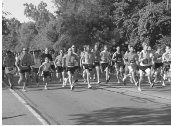
The Happy Trails 5K is one of the region's premier walk/run events.

Special Family Entry Fee: $65 for four or more family members (mail-in or phone registration only). Reservations.