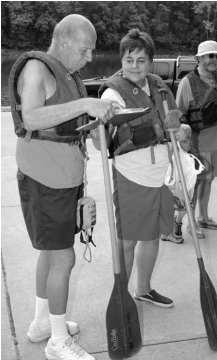
Can you canoe? Introductory class June 18.