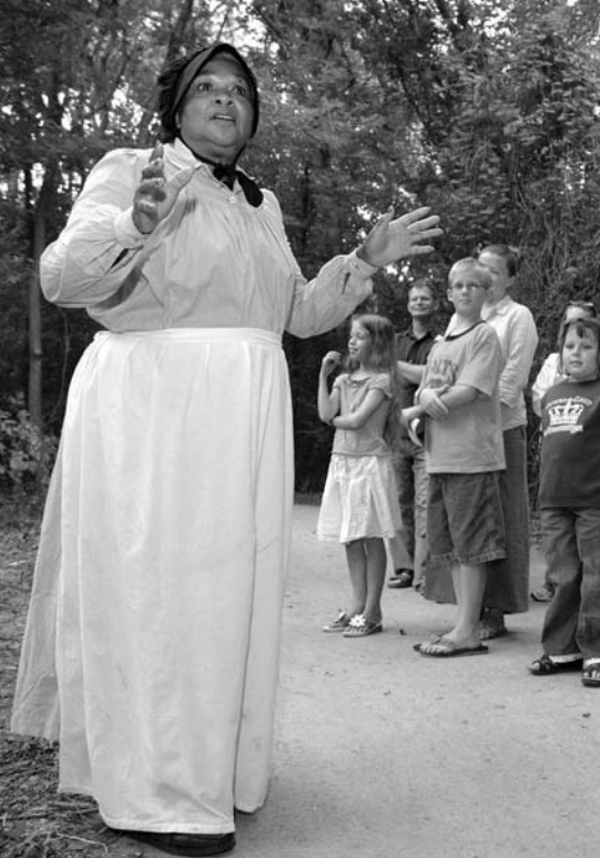
The dramatic stories of slaves and the families who sheltered them come to life during the Underground Railroad Lantern Tour.