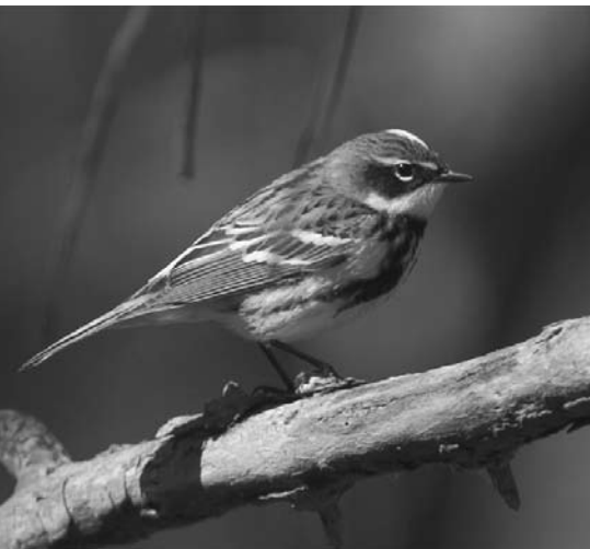
Spring brings an abundance of migrating warblers, which can be seen in all the Metroparks in early May.